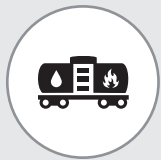
Fuel / Petrochemical