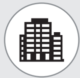
Regional / Distribution