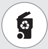
Municipal & Waste